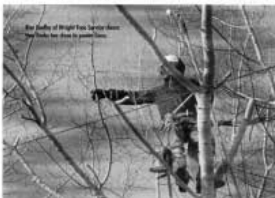
For details of Wright Tree Service, visit our website for more information.