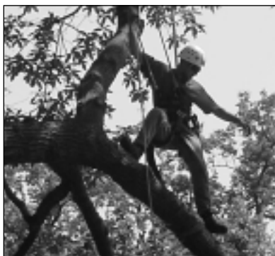
Foreman Jeremy Fox placed first in the throw line competition at Topeka.