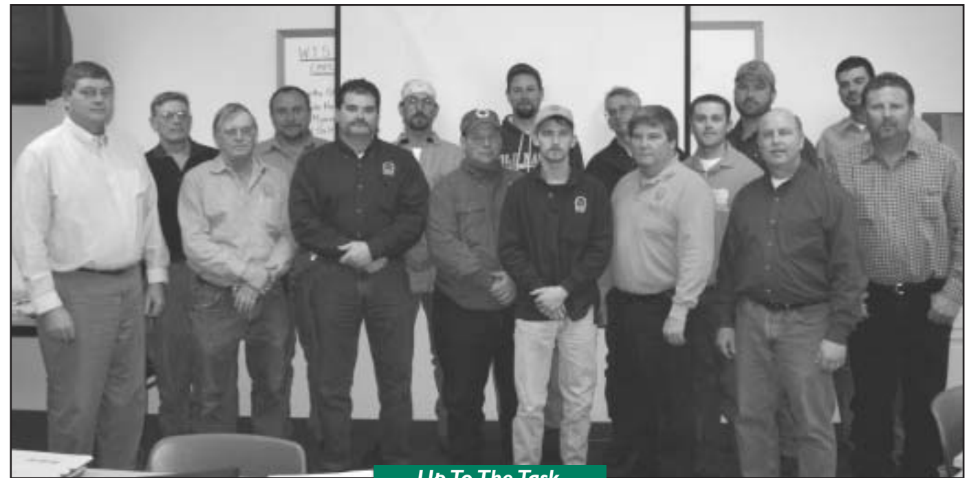
Up To The Task