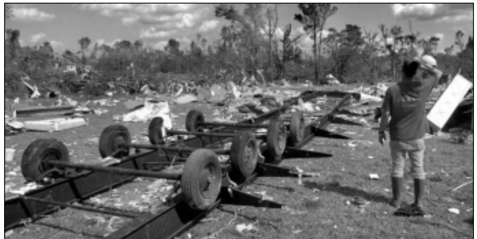
All this man could do was scratch his head as he viewed the destruction.