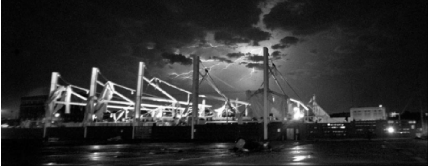
The storm ripped off the roof of the new Shreveport, LA bus terminal.