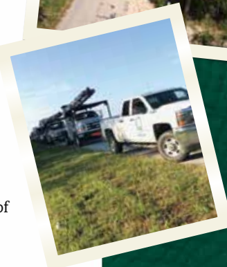
▲ After 16 days, crews from Clarksville, Tennessee were able to make their trek home.